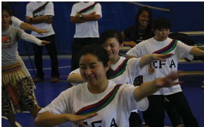
Chinese and Japanese delegates learn the hula.

Each year, ICFA hosts a U.S.-Japan-China Friendship Youth Delegation in Hawaii and for the past several years