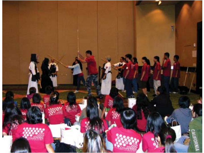
While waiting between competition rounds, student participants enjoy a hands-on demonstration lead by members of the Ken Yu Kai Kendo Club. The students also enjoyed a Japanese dance demonstration from the Hanayagi Dancing Academy and a Nob demonstration by members of the UH Department of Theatre and Dance.