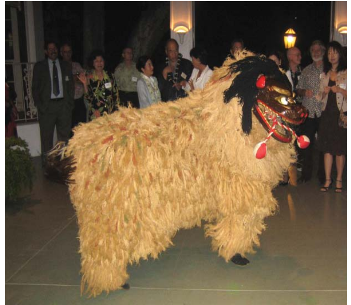
JASH members and guests enjoy a shishimai performance by members of the Young Okinawans of Hawaii.