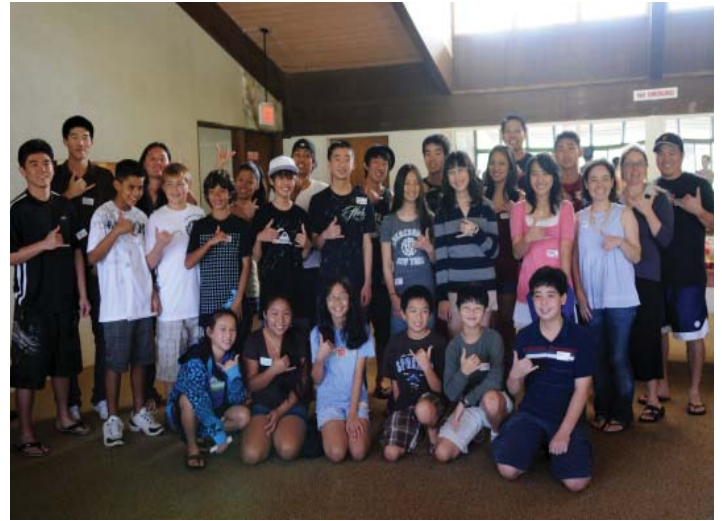
Former APCC Junior Ambassadors and chaperones share the aloha at the Bridge Club's first event.