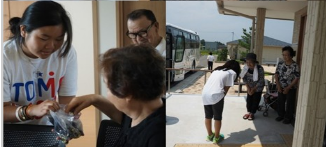
Hawaii delegates meet residents at the Shinchi Temporary Housing.