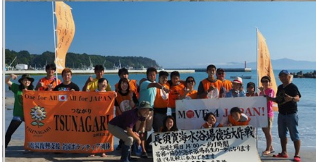
Japanese volunteers of the Sea Monkey Project gather with Hawaii delegates for beach cleanup at Minami-Sanriku.