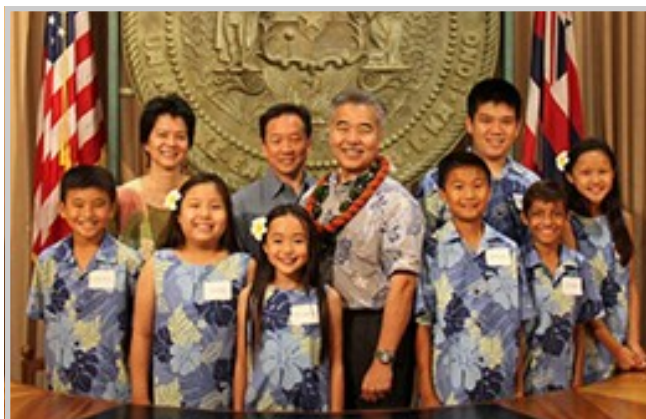
APCC Delegates meet with Governor David Ige on June 30, 2015

Complete versions of articles contained in this newsletter may be read on the JASH website