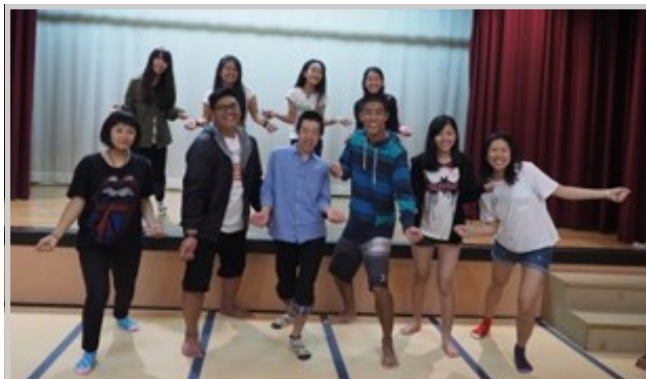
TALP Delegates reunite with RFJK students in Onagawa.

July 7 – 15, 2015 — JASH sent six Hawaii students, ages 12 to 22, and their chaperone to the Tohoku region of Japan as part of the 2015 TOMODACHI – Aloha Leadership Program (TALP), a reciprocal exchange program with Rainbow for Japan Kids (RFJK) program. RFJK allows Japanese students affected by the 2011 Great East Japan Earthquake and Tsunami to travel to Hawaii for mental and physical recuperation, and for learning about Hawaii. This was the third year that Hawaii students traveled to Tohoku to visit and reconnect with RFJK friends made here in Hawaii.