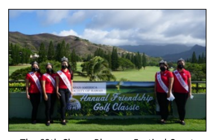
The 69th Cherry Blossom Festival Court

Hope to see you at next year's 32nd Annual Friendship Golf Tournament!