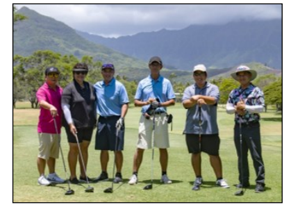
Pacific Guardian Life Teams pictured above

In a "stroke of luck", no pun intended, JASH held our 31st Annual Friendship Golf Classic on July 19, 2021 at a time when COVID-19 cases were just starting to increase from one of its lowest points.