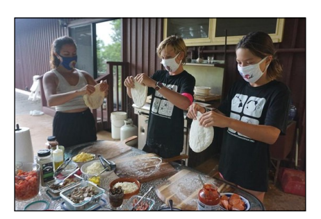
Preparing handmade pizzas

through the most intense games of tag and hide-and-seek.