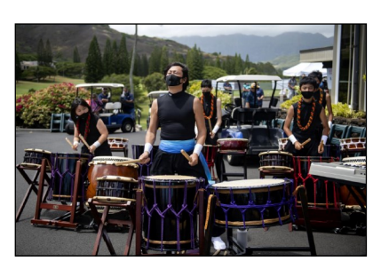
The tournament got off to a rousing start with the thunderous sounds of Dragon Beat Hawaii's taiko drums at the shotgun start.