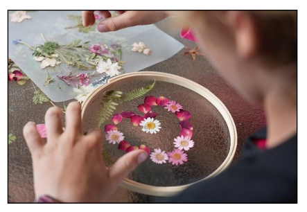
Making suncatchers with pressed flowers