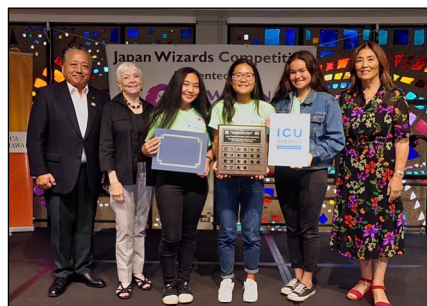
Konawaena High School Level A Team receiving the plaque for the Tateuchi Memorial Award, certificate for Japan trip, and International Christian University Special Award