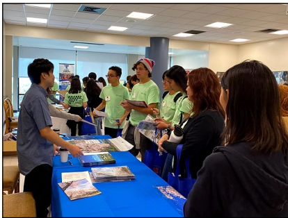
Students learn about higher-education opportunities at the JWC College Fair.

JASH Corporate Member and supporting organizations including Hawaii Tokai International College/Tokai University, Hosei University, International Christian University, International Pacific University, Lighthouse/JTB College Tours, Temple University Japan Campus and Tokyo Management College.