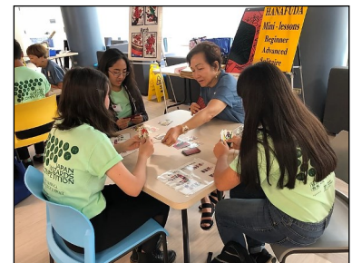
Students learning the basics of Hanafuda from a representative of Hanafuda Hawaii

Between competition rounds, students were kept busy with numerous activity stations in the Activity Center. These included Gytaku Fish Printing by Prior 2 Pupu Productions, Hanafuda by Hanafuda Hawaii, Origami by Hawaii Origami Club, Pictionary, the Chopsticks Game, Ohajiki and other fun activities.