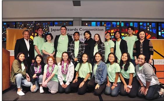
Group-shot of the six JWC teams who won trips to Japan at this year's competition.