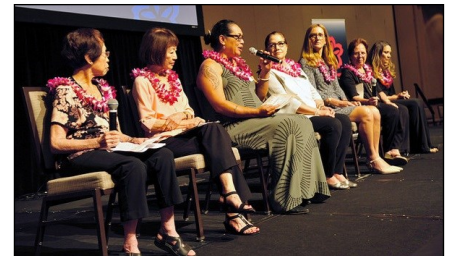
Several descendants of the Gannenmono were invited to speak at the event.

On June 7, 2018, the Kizuna group (a consortium of 21 Japan-related organizations) hosted the "Gannenmono Symposium" at the Sheraton Waikiki to commemorate the 150 th Anniversary of the arrival of the first Japanese immigrants from Japan.