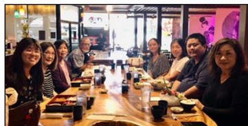
Some of the JIAS Volunteers and JASH Staff enjoy lunch at Kanoya

Japan-in-a-Suitcase is a program that gives students in kindergarten through 5 th grade the opportunity to learn about the concept of Different Perspectives through interactive