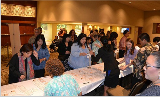
Top left: The crowd gathers before the program begins.