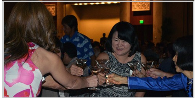
Bottom right: Guests share a kanpai with sake donated by The Cherry Company.