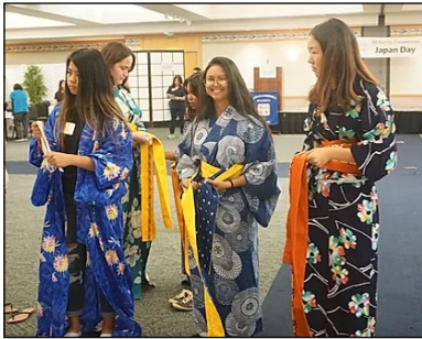
Students trying on traditional Yukata.

on bon dance, calligraphy, ikebana (flower arranging), karate, kimono/yukata wearing, origami, soroban (Japanese abacus), tea ceremony and a seminar on Life Skills and Personal Success.