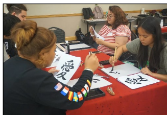
Students trying their hand at Shodo (Calligraphy.)