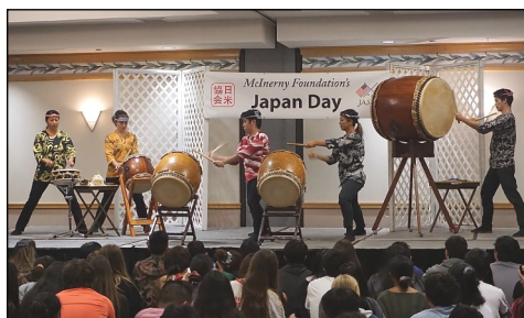
Taiko Center of the Pacific performing at the Opening Ceremony.

Approximately 200 students from Kailua High School, Kapaa High School, King Kekaulike High School, Konawaena High School, Lahainaluna High School, Maui Preparatory Academy, Molokai High School, Nanakuli High School, University Laboratory School and Washington Middle School gathered at the Japanese Cultural Center of Hawaii's Manoa Grand Ballroom to enjoy the day's activities. Held twice a year, Japan Day is JASH's longest running educational program which is offered free to Hawaii's middle and high schools. Since its inception in 1993, over 6,700 students from 65 different public and private schools have participated in this educational program.