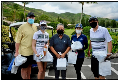
Corporate Sponsor Cushman Wakefield ChaneyBrooks team