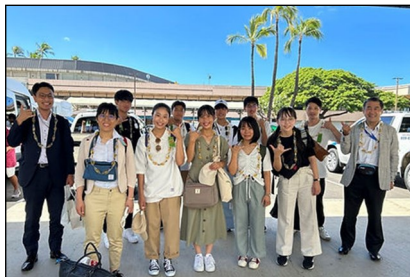
EPIC students arrive at the Daniel K. Inouye International Airport.