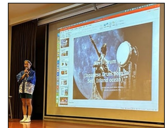
EPIC student participant giving a presentation about taiko.