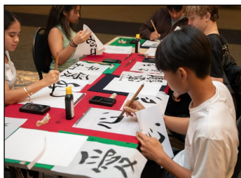
Students practice Calligraphy strokes.